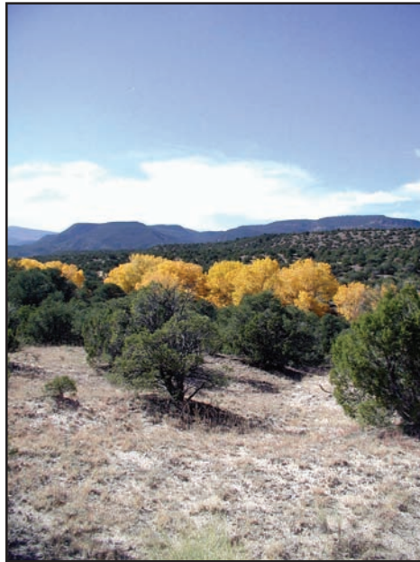
View of the Rio del Oso, looking north over the golden October aspens.

Jicarilla women provided the bulk of micaceous cooking vessels to Hispanic and Pueblo kitchens of the Chama during the nineteenth century. In so doing, they were major players in the multiethnic economy of the region prior to the turn of the last century. This economy had its benefits. Trade with settled villagers allowed the Jicarilla to resist American attempts to settle them on a reservation well into the 1890s. Unlocking the mysteries of this unassuming valley revealed a previously unrecognized pattern of cultural accommodation and persistence that was regional in scope and part of the enduring legacy of Northern Rio Grande society.